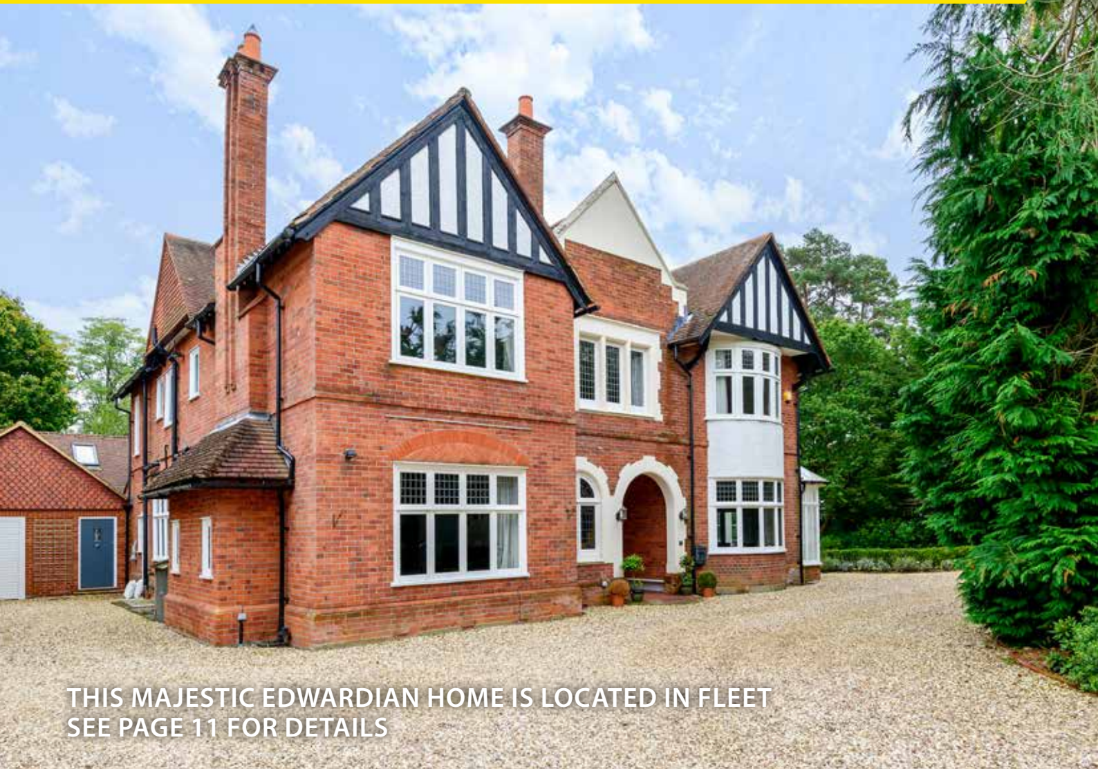
THIS MAJESTIC EDWARDIAN HOME IS LOCATED IN FLEET SEE PAGE 11 FOR DETAILS

a unique, proactive way to market your home - since 1990