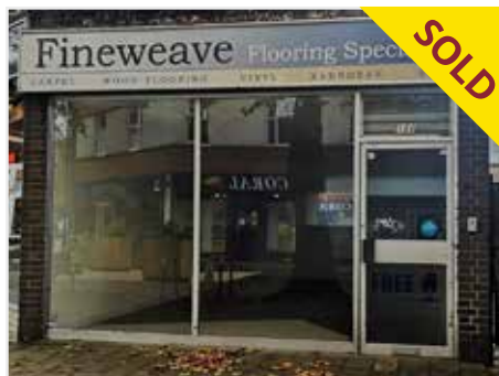
Fleet Road, Fleet Retail Shop