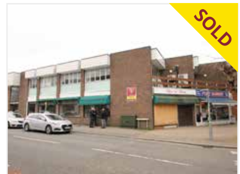
Fleet Road, Fleet Retail Shop with Offices above