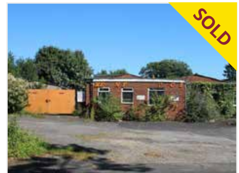
London Road, Old Basing Industrial