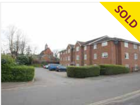
Reading Road, Farnborough Investment