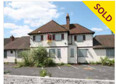
The George, Ash Vale Public House