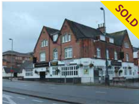
Cambridge Hotel, Camberley Hotel & Public House