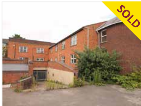
Queens Road, Farnborough Offices