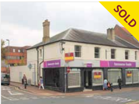
High Street, Camberley Retail Shop